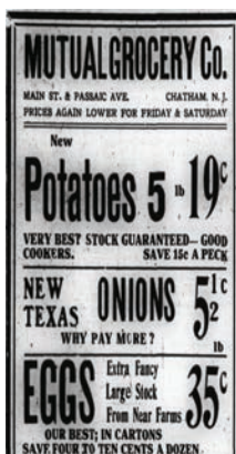
Chatham Courier 1922

Inflation affects different sectors of the economy in different ways. For many items, food costs are about the same today as they were in the 1920s. 35¢ x 17 will still purchase a dozen eggs ($5.95). Before the recent spike in prices, gasoline was actually less expensive than in the 1920s. Cars, on the other hand, are much more expensive. Ford sold its basic car for $285 in 1922, which would be just under $5,000 in 2022 dollars.