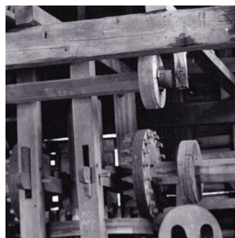
Wooden gears, Mott grist mill

At its peak, the Mott Hollow complex included grain, fulling, carding, saw and oil mills, a rope walk, and small trade shops. In size and the value of land, in the 1820s it far exceeded nearby Dover. Unfortunately, Mott Hollow felt the economic effects of the War of 1812 and was eventually eclipsed by the growing nearby industrial town of Dover. Over time: