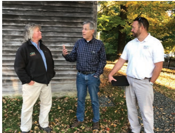
Meeting with Fullerton Ground Maintenance to discuss fall clean up plans

process of replacing the roof will begin. (Planning for both the grounds and roof is funded by our grant from the Morris County Historic Preservation Trust Fund.) Installing a new cedar shake roof is expensive, in part because the shakes must be specially made and in part due to the cost of removing the asbestos layer installed in the 1970s. By March of next year, the construction documents and contracts required for bidding will be finished, which should coincide with the release of the construction funds approved in our New Jersey Trust Fund grant.