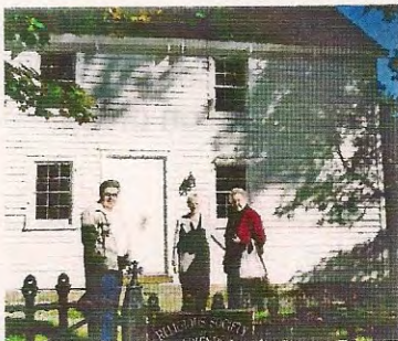
Meeting House—1996