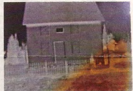
Meeting House—1901