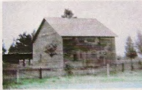
Meeting House—1899