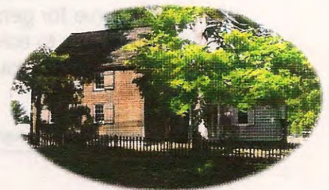
M.H. 250 Anniv- 2008